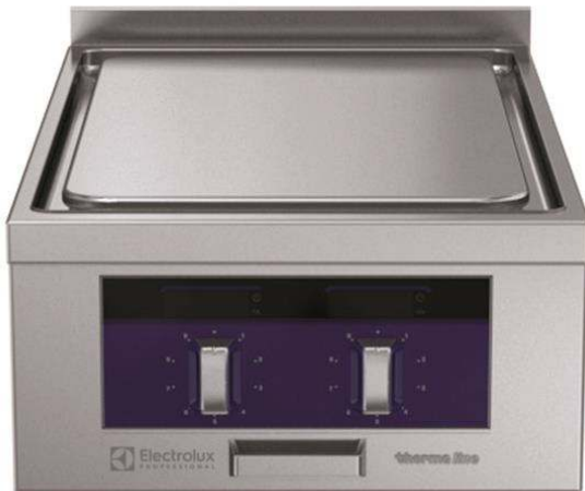
588004 (MALBABEOAO) Electric solid top, 2 zones, ecotop coating, one-side operated with backsplash